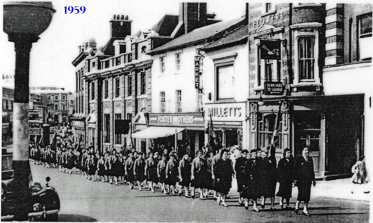
The parade of 1959, with lines of guides marching up Market Hill on their way to the parish church. They are passing the Plough public house. The entrance to the covered market is situated between Milletts and Foster Brothers. All the buildings on the right have been swept away to make room for the Arndale Centre.